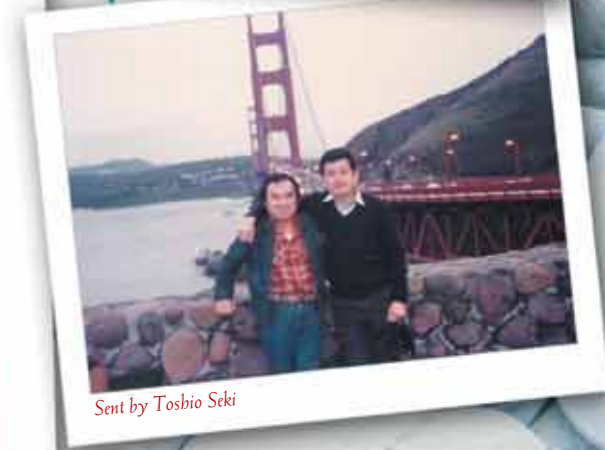
Sent by Toshio Seki