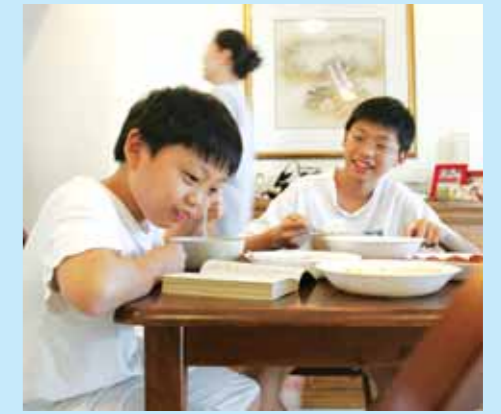
Brothers enjoying a meal at home.

What happens in Central Singapore during the course of a day? Voices attempts to capture slices of life in the District with photographs of people going about their daily lives from morning to night. In this fourth part, we look at what goes on at 7pm in Central Singapore.