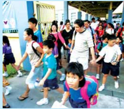
Kids going home after school.