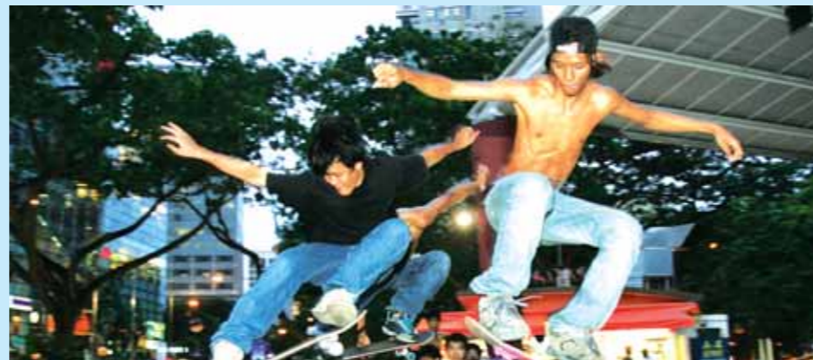
Skateboarding at the National Youth Park.