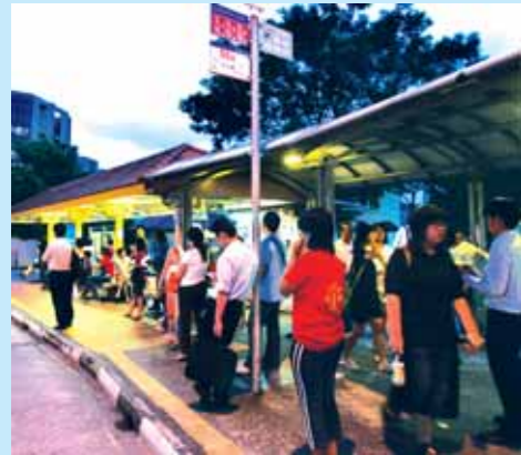
Commuters wait by the bus-stop.