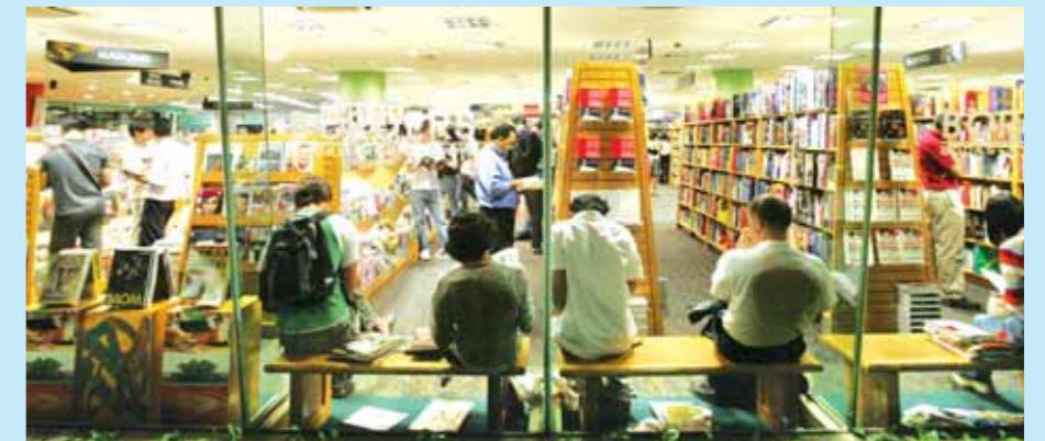
Browsing away at a bookshop.